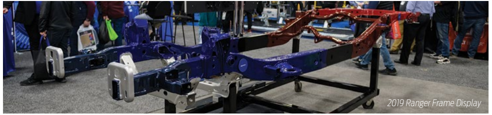
2019 Ranger Frame Display

The expanding NORTHEAST® Automotive Services trade show, in Secaucus, N.J., served as the backdrop recently as Ford Motor Company gave the collision repair industry its first official close-up look at the all-new high-strength-steel frame of the revived 2019 Ford Ranger.